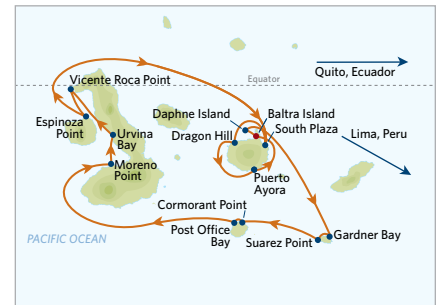
13-Night ALL-INCLUSIVE Galapagos Cruise Itinerary A Galapagos Islands & Best of Ecuador & Peru; Quito to Lima