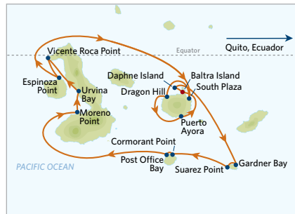
10 & 11-Night ALL-INCLUSIVE Galapagos Cruise Itinerary A Galapagos Islands & Quito Quito Round-trip