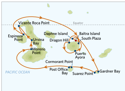
7-Night ALL-INCLUSIVE Galapagos Cruise Itinerary A Galapagos Islands Baltra Round-trip