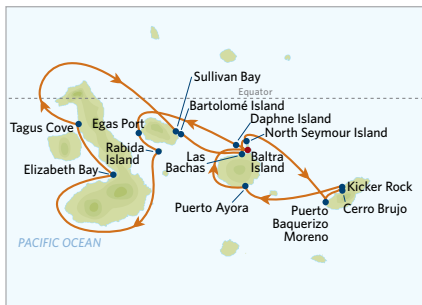
7-Night ALL-INCLUSIVE Galapagos Cruise Itinerary B Galapagos Islands Baltra Round-trip