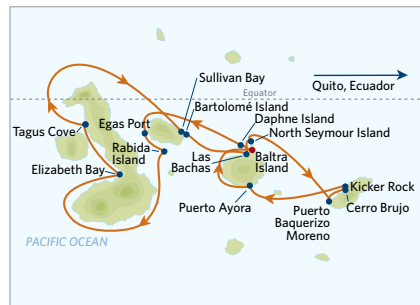
10 & 11-Night ALL-INCLUSIVE Galapagos Cruise Itinerary B Galapagos Islands & Quito Quito Round-trip