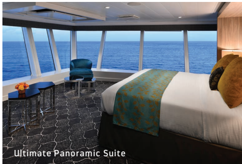
Ultimate Panoramic Suite