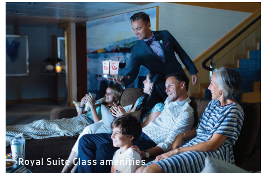
Royal Suite Class amenities

In the city that never sleeps, adventure — and luxury — is no exception. Step aboard the first Oasis Class ship to sail from New York and call one of the most spectacular suites at sea your home. From the all new Ultimate Panoramic Suite with sweeping 200 degree views to a two-story Loft Suite or one of the famous AquaTheater Suites where entertainment meets awesome accommodations. Plus enjoy Royal Suite Class amenities like VIP access shipwide and even your own Royal Genie. And outside your door, plunge down the tallest slide at sea, Ultimate Abyss SM . Dig into deliciousness at over 20 of the best eats on fleet, now including pitmastery perfection at Portside BBQ SM . And make it a date night to remember with coded cocktails at the new Bionic Bar ® , plus many more of our best nightlife hotspots. All this and a bragworthy beach day at Perfect Day at CocoCay make Oasis of the Seas ® the boldest family vacation ever.